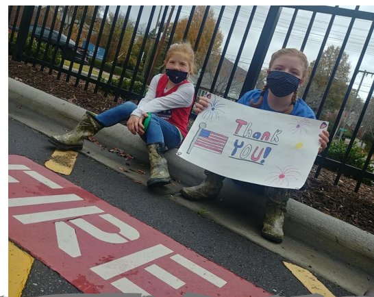
Pictured Above: Left & Right - 4-H youth and adults honor Veterans at the Cabarrus Boys & Girls Club Annual Veteran's Day Event. Center: T-Shirts are available for purchase from NC Collegiate 4-H. Design Contest Winner from Wayne County.